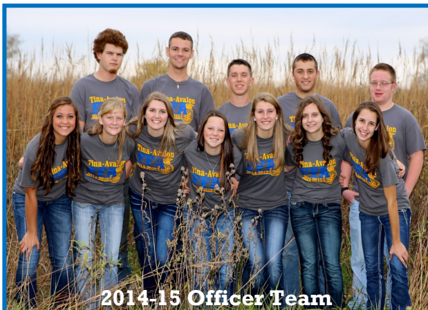
2014-15 Officer Team